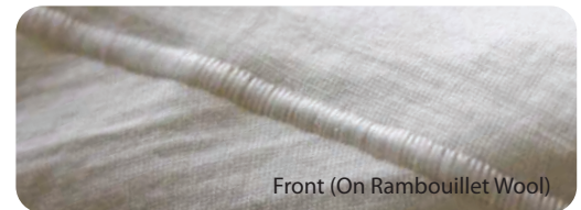
Front (On Rambouillet Wool)