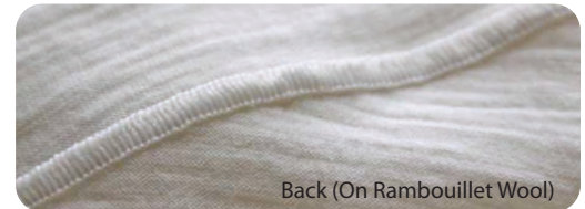
Back (On Rambouillet Wool)